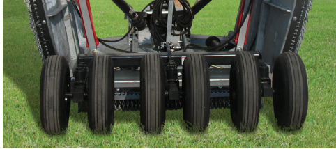
Triple Center Axles are standard on the 20' Super Predator. Shown here with standard used aircraft tires.