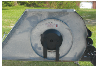
Smooth underdecks make for more efficient mowing and less area for rust to begin. Deck rings are standard.