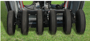
Triple Center Axles are standard on the 20' Predator. Shown here with optional used aircraft tires.