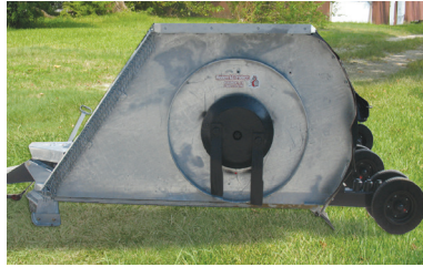
Smooth underdecks make for more efficient mowing and less area for rust to begin. Deck rings are standard.