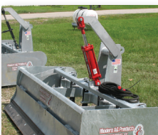
Includes 3" x 8" hydraulic cylinder with hoses.