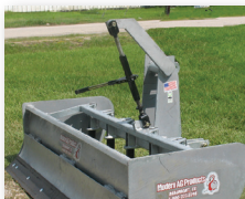
Industrial Box shown w/ optional hydraulic lift